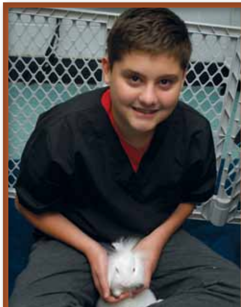
SMALL ANIMAL CARE SKILLS

At Wilson Tech's Huntington campus, students learn practical skills in the appearance enhancement industry.