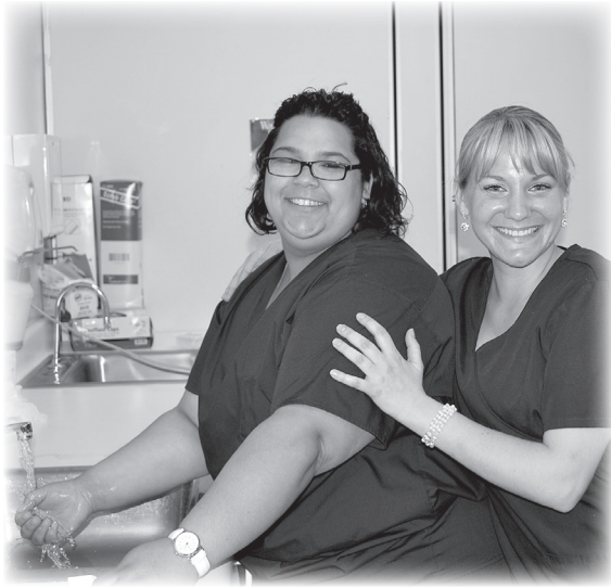
The nurse assistant is a key person in today's health care

W hile studying to become a certified nurse assistant in this NYS-approved program at Western Suffolk BOCES, you will learn many different procedures that make a difference in the daily care of people. You'll learn everything from communicating effectively with those who are ill to making a bed with a person in it. You'll also learn how body organs function and what you can hear with a stethoscope.